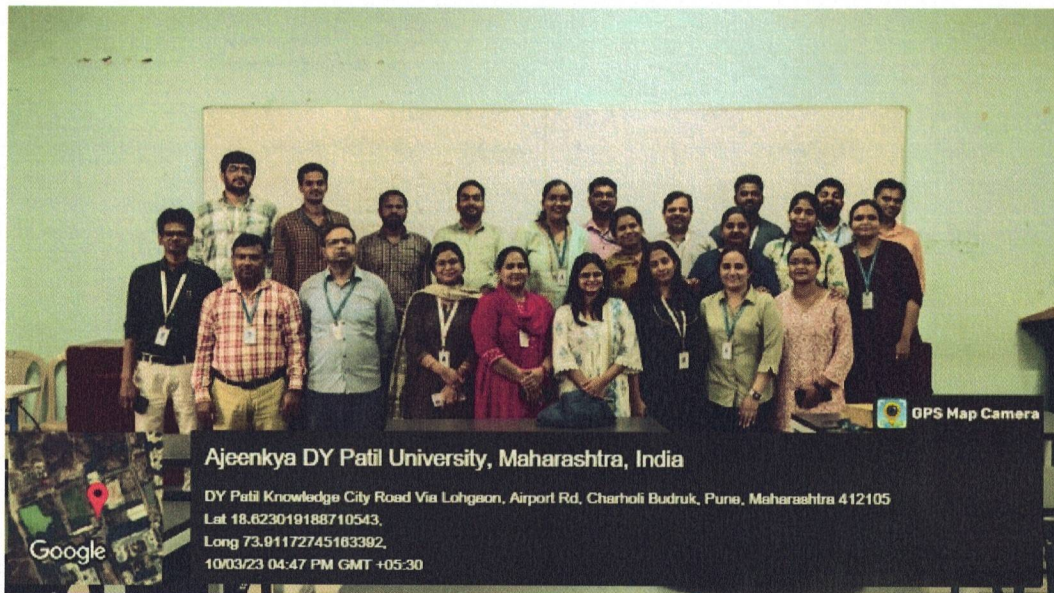
Fig: Skill Development seminar