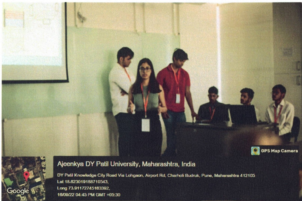
Fig: FDP on Innovative Ways of Teaching.