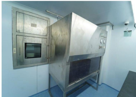
Dynamic Pass Box