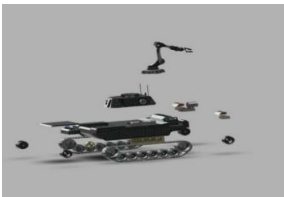
Fig 1.4 Dismantled CAD View of Abhimanyu

Below you find the exploded version of the robot through which all the parts can be seen clearly.