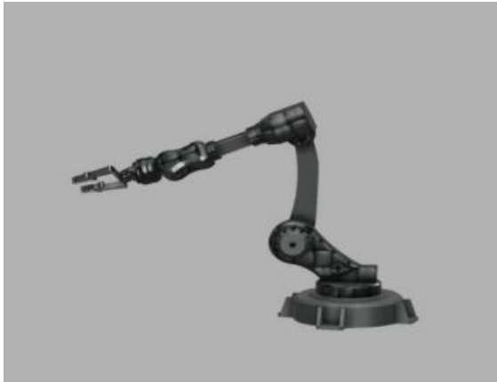
Fig 1.3 CAD diagram of the Robotic arm.

There are also some internal parts like the power generator, coolers, cylinders which are overall needed for the proper working of the UGV.