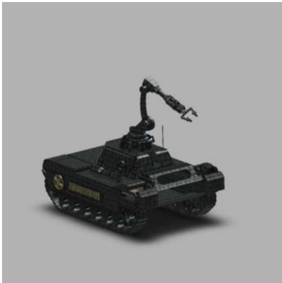
Fig 1.2.CAD diagram of Abhimanyu, created using Fusion 360..

This model is the base and has been made with carbon fibre. Later in the section you will find the model with some metal on it. It has been designed for the whole and sole purpose of military surveillance and bomb diffusion