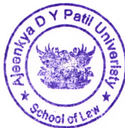
Signature of Dean